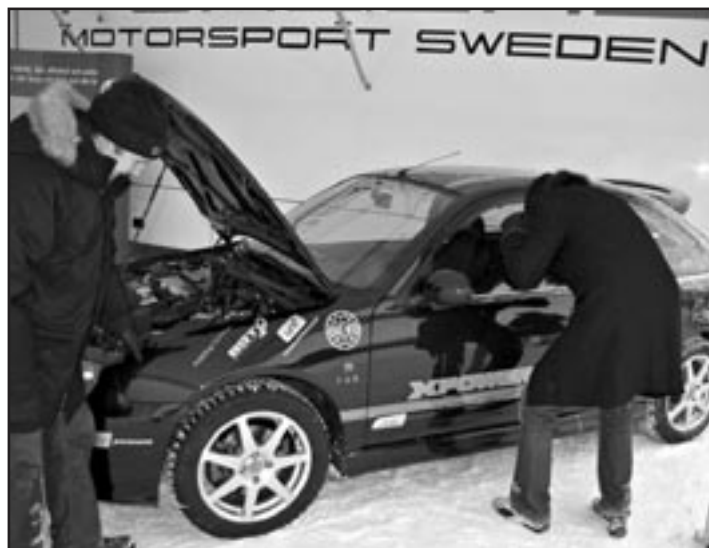
This is the car that 20 pupils in Arjeplog will use when they participate in STCC 1600 racing. There will be eight competitions starting in May.

The conditions of this project were to stay sober and to take care of their normal school work.